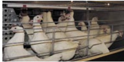
Commercially available furnished cage