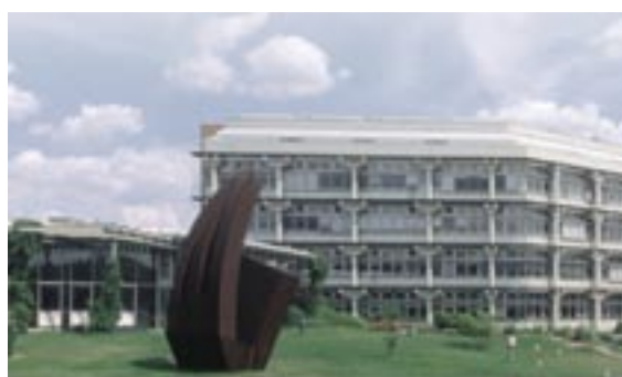
Conference venue in Berlin

EU Welfare Quality® Project: www.welfarequality.net/everyone/36059