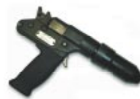
Captive bolt gun with extended bolts - being tested as a stand alone euthanasia tool